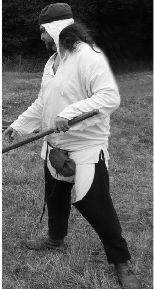
Dore Abbey's Skeleton - and what he may have looked like.